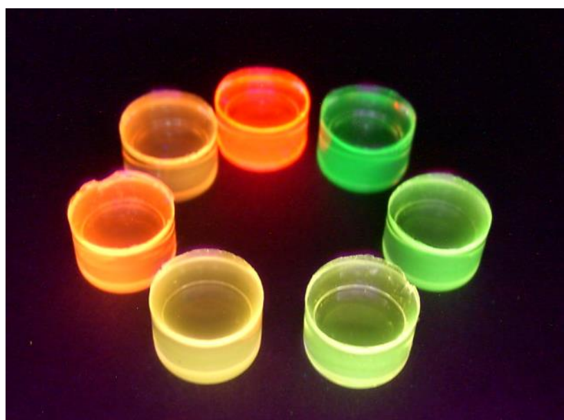
Figure 3: The molecular design method has the potential to create phosphors that emit different colored light when applied to different luminescent complexes.

Researchers from Toshiba will present the technology and showcase red LEDs and fluorescent films as applications at the 29th International Display Workshops (IDW '22)